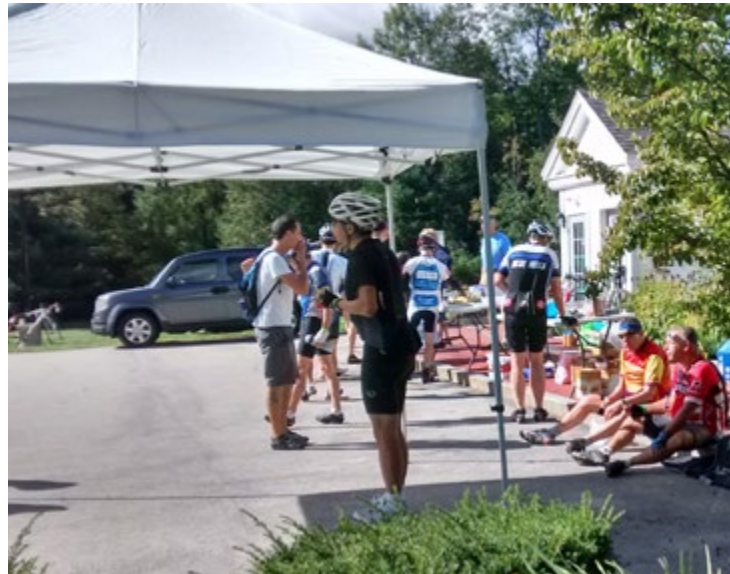
Riders taking a break at water stop.