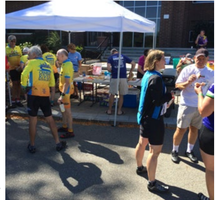
Riders enjoying food and refreshments after the ride.