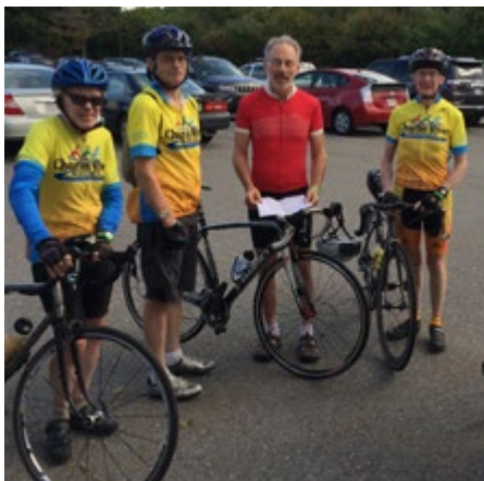
Riders at the start getting ready to roll.