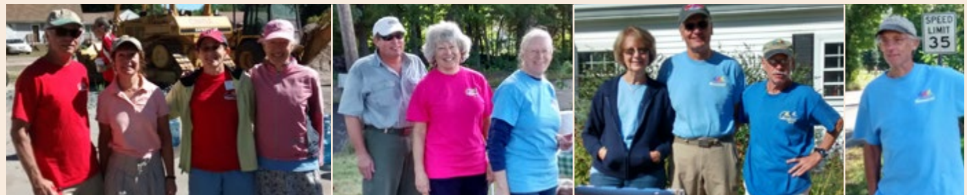
Our dedicated water stop volunteers.